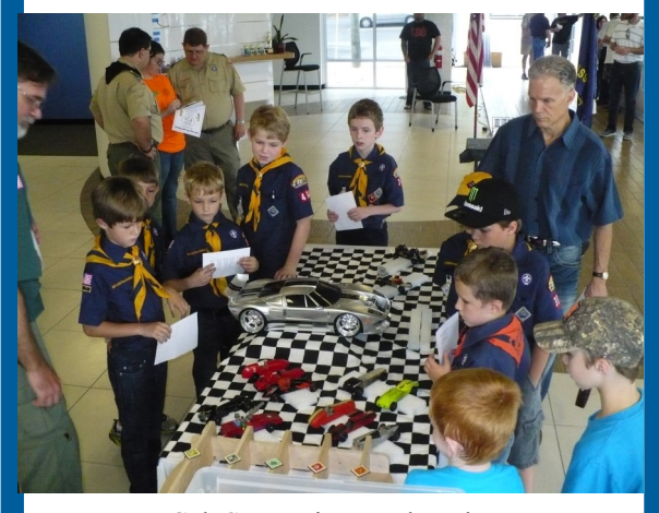
Cub Scout Pinewood Derby Learning life skills, while having FUN!