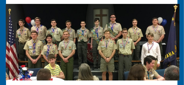
Eagle Scout Recognition Banquet Our finished Product